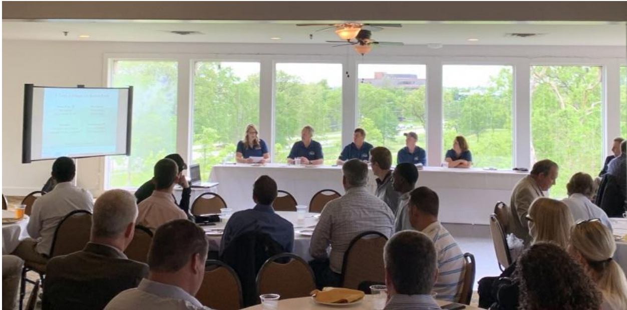
A panel discusses the design-build project delivery method from the differing perspectives of the owner, the community, the contractor and the designer. (May 2019)